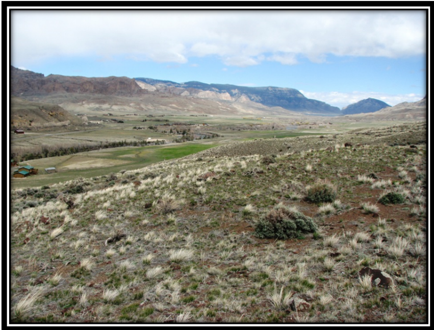
Views from Property